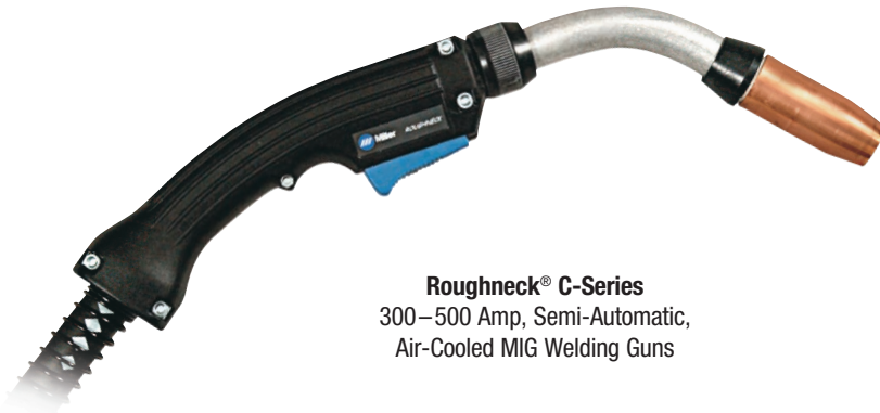
Roughneck® C-Series 300–500 Amp, Semi-Automatic, Air-Cooled MIG Welding Guns