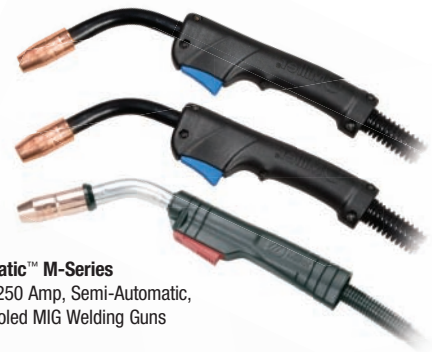
MIGmatic™ M-Series 100–250 Amp, Semi-Automatic, Air-Cooled MIG Welding Guns