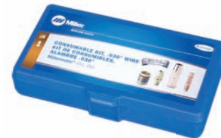
M-Series Consumable Kits (#234 610, #234 611, #234 612) contain 10 contact tips, 1 nozzle, 1 contact tip adapter and 1 nozzle adapter.