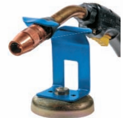
MIG Gun Holder #229 614