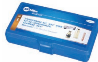
M-Series Consumable Kits (#234 607, #234 608, #234 609) contain 10 contact tips, 1 nozzle and 1 contact tip adapter.